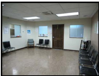
Large Reception / Waiting Area

The R.A. Pollett Building is fully accessible and has ample parking for tenants and clients. The Corner Brook Port Corporation has a large boardroom available for tenant use. It is also located on the second floor and can be accessed directly from the second floor corridor.